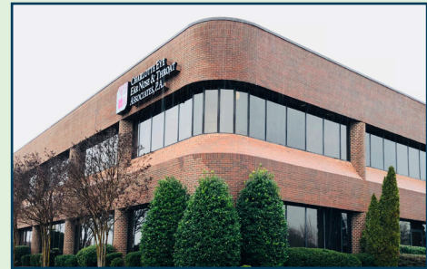
Our Pineville office